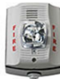
P2WK Spectralert 2-wire outdoor wall/horn strobe,