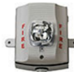
SWK Outdoor wall strobe, white