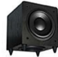
FS10 10" dual-drive floor standing speaker