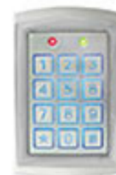
SK-1323-SDQ Enforcer sealed housing weatherproof outdoor digital access keypad, 1010 users, two 1-amp relays