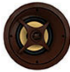
C675S 6.5" ceiling LCR speaker