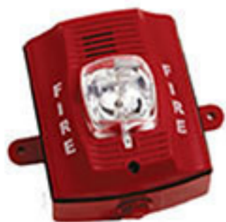
P2RK Spectralert 2-wire horn strobe, outdoor, standard