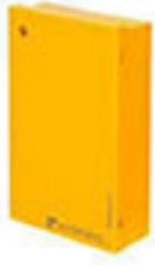
PM-07-SIO-E Single io door controller