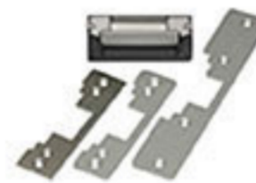
SD-996C-NUQ Universal door strike for wood or metal, 3 faceplates included,