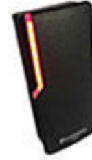
PP-08-RDR-M Mullion reader