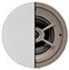
C621 6.5" ceiling speaker