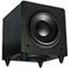
FS12 12" dual-drive floor standing speaker